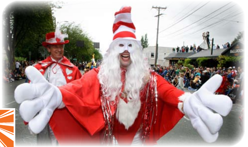
Super Hugger